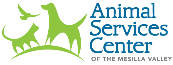
Exhibit A, 2021-02 New Adoption Fee

All dogs and cats start at $150.00 adoption fee.